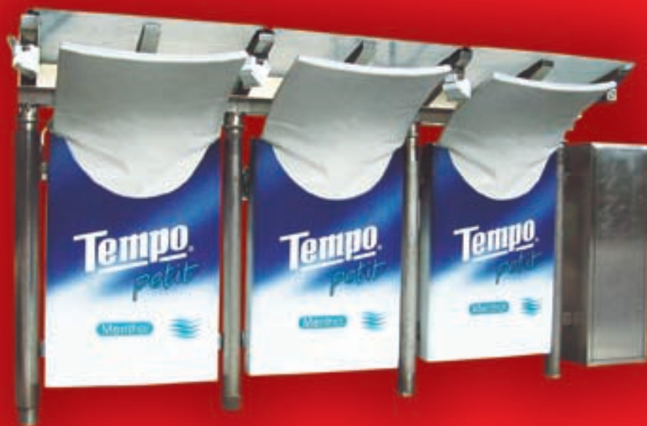
Innovative Bus Shelter in Hong Kong 位於香港創新的 乘客候車亭