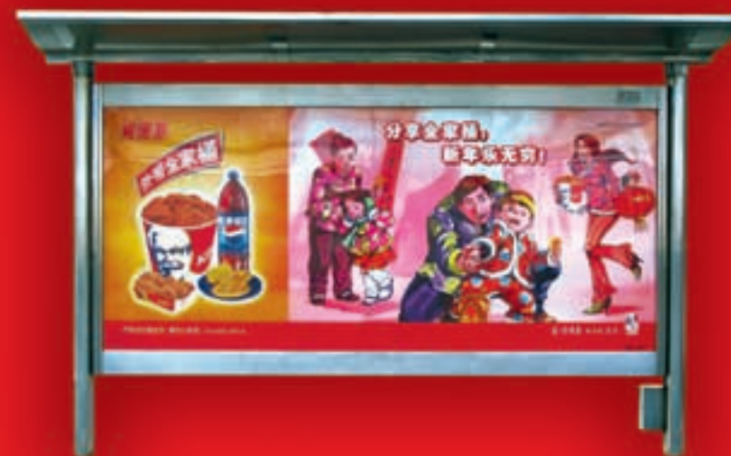
Bus Shelter Advertising in Beijing 位於北京的 乘客候車亭廣告