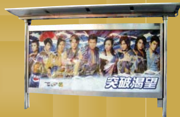
Passenger Shelter Advertising in Beijing 位於北京的乘客候車亭廣告